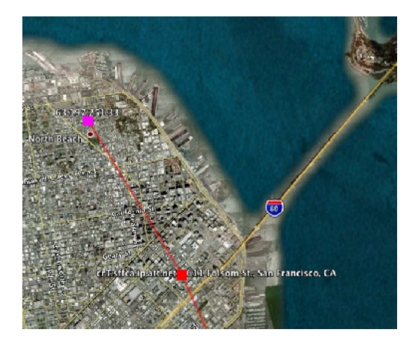
Figure 2: IXmaps rendering of traceroute #1859 with Google Earth – San Francisco business district zoom (screenshot)